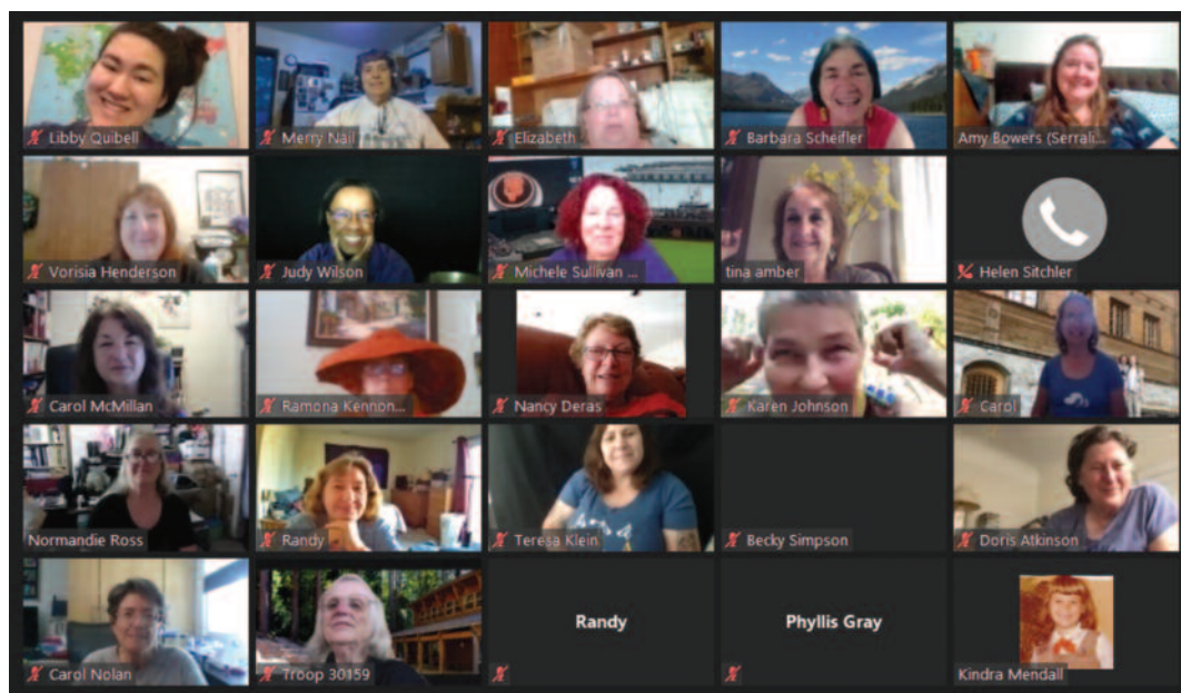
More Zoom meeting members

Annual Meeting: Saturday, September 12, 2020 10:00 - Noon, via Zoom.